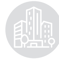
Non-Council building decarbonisation