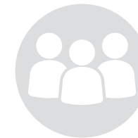
Other enabling projects