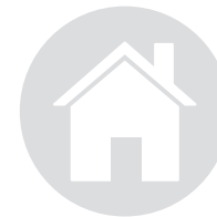
Domestic energy efficiency