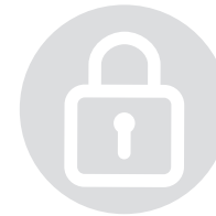
Energy security across the city