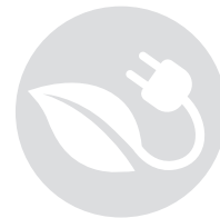
Council building decarbonisation